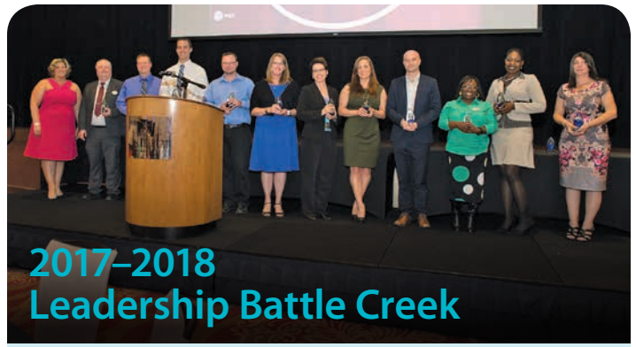
2017-2018 Leadership Battle Creek

Are you an artist, musician, street performer, or business interested in participating in a fun-filled artistic evening? Visit battlecreek.org to register online, or call the Chamber at 269.962.4076 .