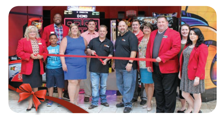
Lakeview Square Mall Ribbon cutting on June 8. FunShop Extreme is next to NCG Cinema and is home to the World's Largest PACMAN game! The new, expanded arcade is full of fun, interactive games and amusements that will keep kids and kids-at-heart entertained. 5775 Beckley Road, Battle Creek, MI