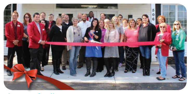
The Arc of Calhoun County The Chamber Staff, Ambassadors, Members and the community celebrated The Arc of Calhoun County's 1 year anniversary at their new location, and 63 years of advocacy and support to individuals with disabilities within our community. The Open House was from noon to 4 p.m. and was open to the public. 506 Riverside Drive, Battle Creek, MI 49015