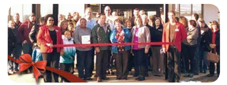
Habitat For Humanity opened its doors Saturday, November 15 with a grand opening celebration. Now located at 595 North Ave., this location provides a wonderful location for those looking to donate household items, building materials and repurposed treasures. Stop in today to support the amazing work being done by Habitat in Battle Creek!